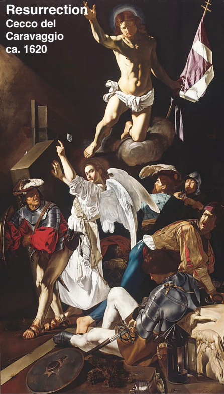
Resurrection Cecco del Caravaggio ca. 1620

The painting depicts the moment of the resurrection, described by Matthew 28:2: There was a violent earthquake, for an angel of the Lord came down from heaven and, going to the tomb, rolled back the stone and sat on it. And his appearance was like lightning, and his clothing as white as snow. The guards shook for fear of him and became like dead men.