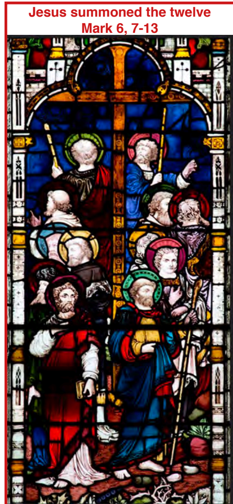
Jesus summoned the twelve Mark 6, 7-13

To receive newsletter each week, email corpus.christi.group@gmail.com or OLL.wheatley.group@gmail.com