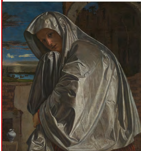
Giovanni Girolamo Savoldo, 1480-1548 National Gallery

Thursday is the Feast of ST MARY MAGDALENE