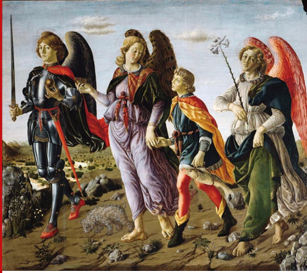
The Three Archangels with Tobias Francesco Botticini c. 1470

Wednesday is the Feast of Saints Michael, Gabriel and Raphael, Archangels