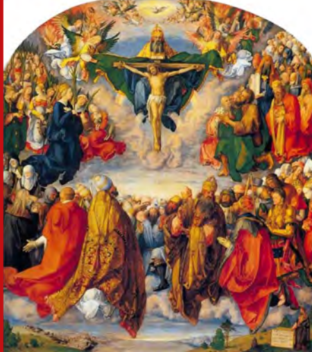
All Saints (Adoration of the Trinity); Albrecht Dürer, 1511 Kunsthistorisches Museum, Vienna, Austria.

Next Sunday we celebrate the Solemnity of All Saints