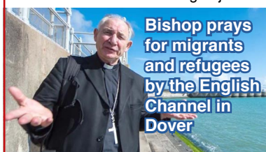
Bishop prays for migrants and refugees by the English Channel in Dover

This is a critical moment: COP 26 approaches, vaccinations world-wide seem to be low on the political agenda, refugees are in need at home and abroad. Please come along to join the group - all welcome.