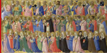
Fra Angelico ca 1423 - The National Gallery "The Forerunners of Christ with Saints and Martyrs"