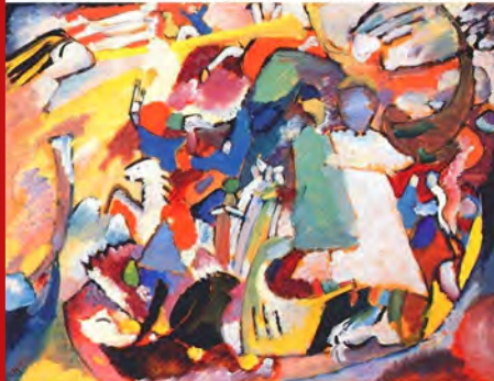
Wassily Kandinsky, 1911 - Munich, The Städtische Galerie "All Saints I"

For all the saints, who from their labours rest, Who Thee by faith before the world confessed, Thy Name, O Jesus, be forever blessed. Alleluia, Alleluia!