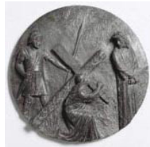
Tolkien Station X

I: Jesus enters Jerusalem; II: Jesus washes his disciples feet; III: Jesus offers Himself in the Broken Bread; IV: Jesus prays in the Garden of Gethsemane; V: Judas betrays Jesus; VI: Peter denies Jesus; VII: Jesus is condemned; VIII: Jesus is scourged; IX: Jesus is mocked; X: Simon of Cyrene takes up Jesus' cross; XI: Jesus is crucified; XII: Jesus is mourned at the foot of the cross; XIII: Jesus reveals himself to Mary Magdalene; XIV: The Lord reveals himself in the Breaking of Bread.