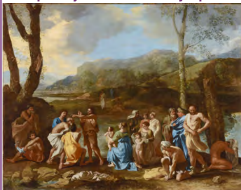
Saint John Baptizing in the River Jordan ca 1630 Nicolas Poussin, 1594 - 1665 Getty Museum, USA

Someone is following me... he will baptise you with the Holy Spirit