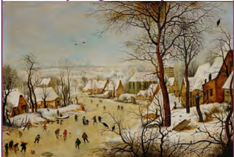
Winter Landscape with a Bird Trap Pieter Bruegel, 1565; Oil on Panel