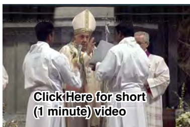
Click Here for short (1 minute) video