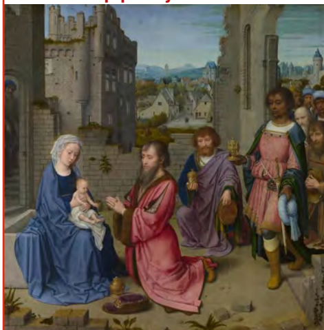
The Adoration of the Magi, Gerard David circa 1515, Oil on oak panel; National Gallery, London