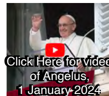
Click Here for video of Angelus, 1 January 2024