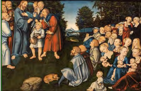
The miracle of the five loaves and two fish, Lucas Cranach the Elder (1472-1553), National Museum of Fine Arts, Stockholm

There is a small boy here with five barley loaves and two fish