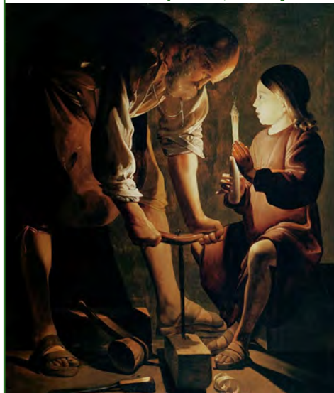
Joseph the Carpenter and Jesus, Georges de la Tour (1593-1652), 1642 Oil on canvas, Louvre Museum, Paris