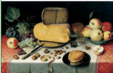
Still-Life with Fruit, Nuts and Cheese, Floris van Dyck (1575 - 1651), Oil on canvas; Frans Hals Museum, Netherlands