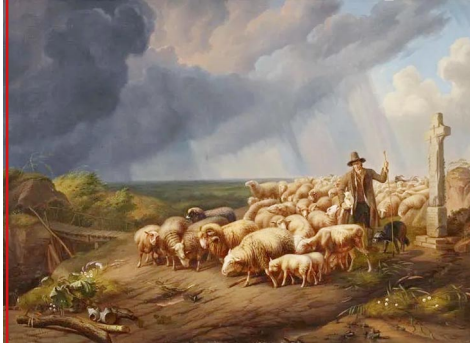
Flock of Sheep overtaken by a Storm, 1870 Eugène Joseph Verboeckhoven (1798-1881), oil on canvas