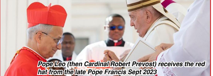
Pope Leo (then Cardinal Robert Prevost) receives the red hat from the late Pope Francis Sept 2023

Pope Leo recalls Francis' legacy of generosity, mercy for Church and world CLICK HERE FOR FULL ACCOUNT