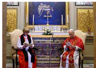
Archbishop Sarah Mullally and Pope Leo in prayer

Birmingham Roman Catholic Diocesan Trustees, Registered Charity No. 234216