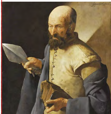
Saint Thomas, ca. 1636

I am the way, and the truth, and the life