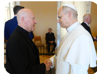
Pope Leo and our Parish Priest

Birmingham Roman Catholic Diocesan Trustees, Registered Charity No. 234216