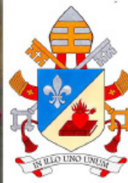
Pope Leo and his Coat of Arms

Jesus tells His disciples: "You give them something to eat"